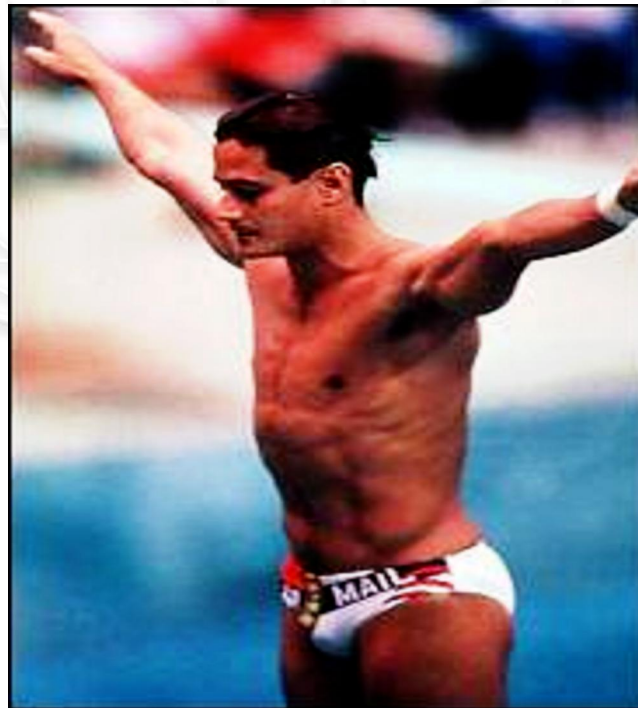
Ready For Take Offō The Elegant Poise Of Greg Louganisō

Once again, he just put it behind him, and nailed the dive perfectly on his next try. A true sporting legend, no doubt about it.